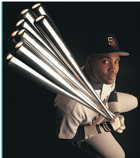
Tony Gwynn

It's a mite easier to win eight batting titles if you can still hit .300 when down to your last strike.